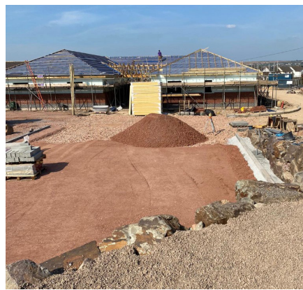
(Ongoing work at Gayton's Funeral Directors in North Devon)

Whilst we continue to follow government guidelines with regards to COVID-19 it has been fantastic to see the team working with Boden Group to ensure our level of service has not been affected. We are continuing to deliver the core contract and are looking forward to returning to business as usual in the not so distant future and have got a healthy amount of projects to look forward to.